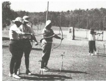
Queensland's Fun and Friendship Camps — a growing market

Since that time 27 camps have been conducted at Tallebudgera. The cost of these camps are currently $117.00