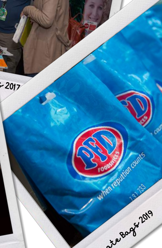
Delegate Bags 2019