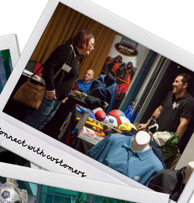
Connect with customers