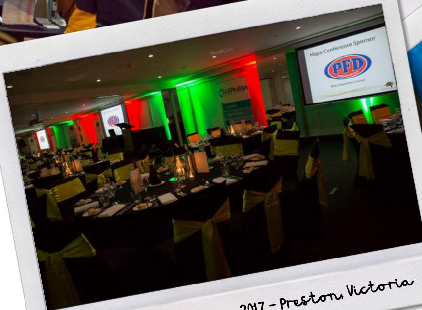
ACA Conference Dinner 2017 - Preston, Victoria