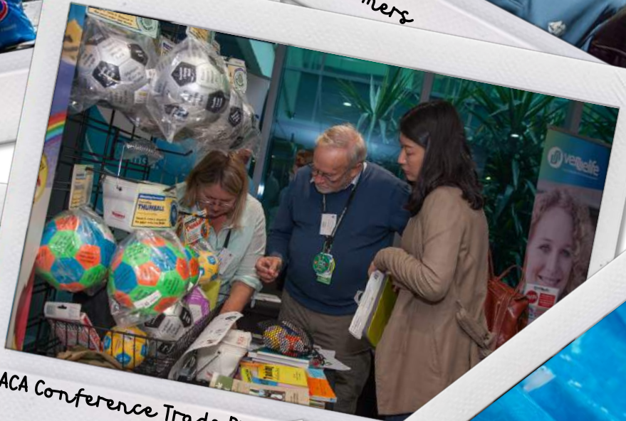
ACA Conference Trade Dis 2017