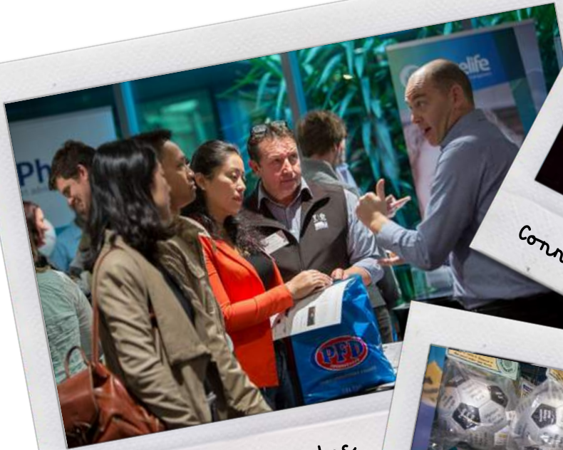
Talk with Delegates