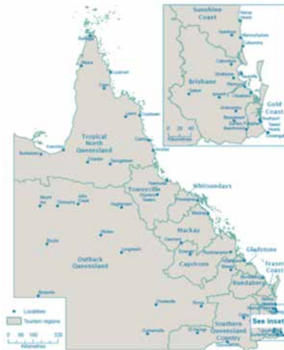
Table 3: Queensland tourism campaign regions

We used the campaign regions because they provide a reasonable level of geographic coverage that matches data availability. Data availability and quality deteriorate with datasets that aggregate tourism activity at smaller geographic scales.