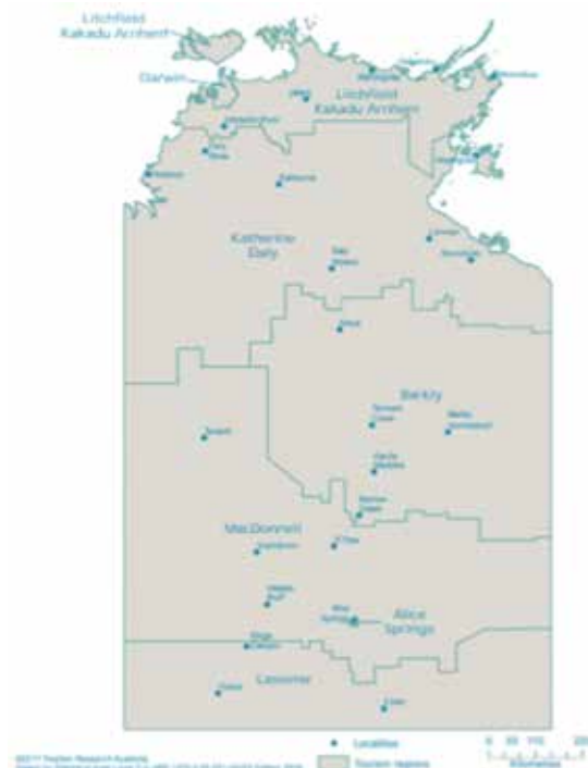
Table 3: The Northern Territory tourism campaign regions

We used the campaign regions because they provide a reasonable level of geographic coverage that matches data availability. Data availability and quality deteriorate with datasets that aggregate tourism activity at smaller geographic scales.