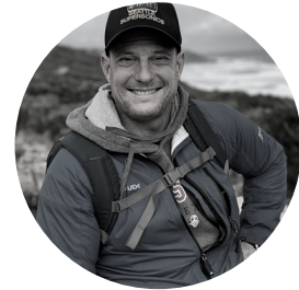
CAMPBELL MESSAGE (VIC)