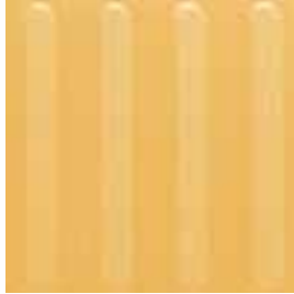
Typical directional tactile surface tile (canary yellow coloured) 7

Texture contrasting: Texture contrasting can also be helpful as tactile markers that people can identify by feel. Examples include carpet matting on a vinyl floor surface, and domed buttons on handrails to indicate the end of the stairway or ramp is approaching.