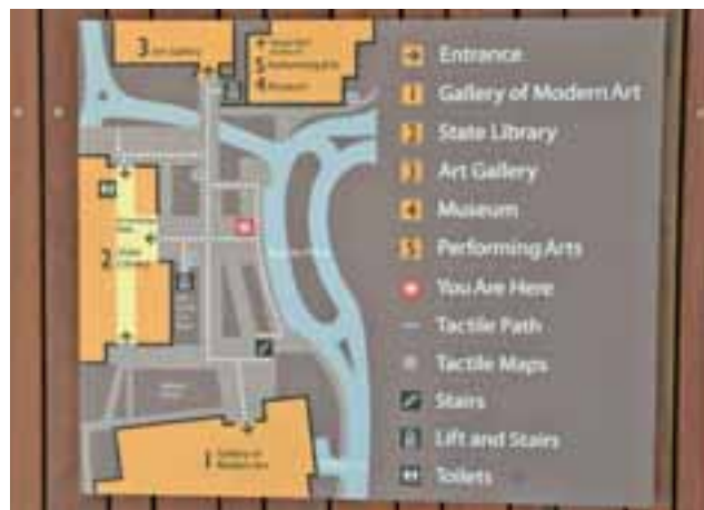
▲ Figure 1 Map design and signage

Location: State Library of Queensland and Gallery of Modern Art (GoMA) at Stanley Place, South Brisbane