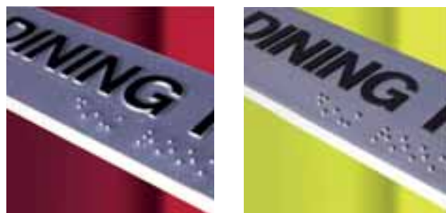
Examples of signage with combinations of tactile and braille

This system of braille is constantly being reviewed and upgraded.