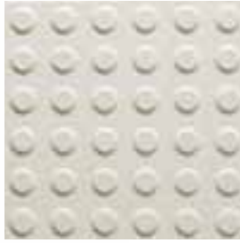
Typical warning tactile surface tile (ivory coloured) 6