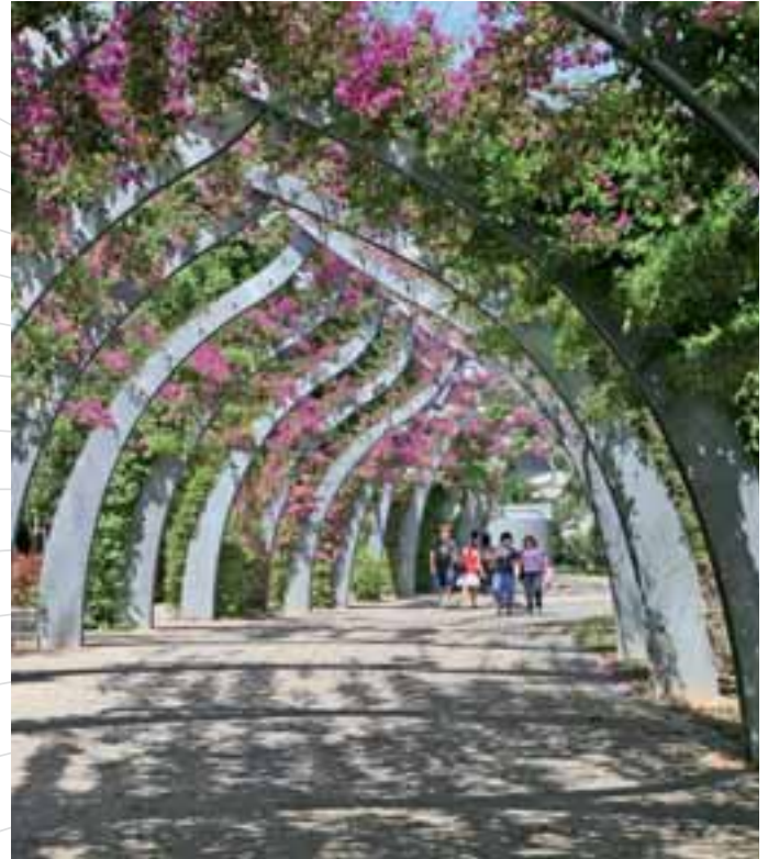
▲ Figure 2 The Arbour — universal accessway

the buildings. However, the design principles remain constant regardless of the type of space or place. They can also be applied to upgrading projects to improve wayfinding around large complexes such as university campuses, hospitals and schools. The checklist and guidance notes are also easily transferable to urban spaces like malls and shopping centres.