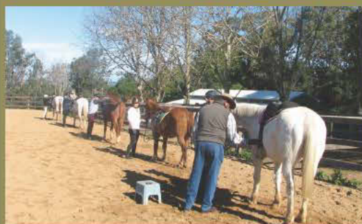
FIGURE 4 Line up for mount