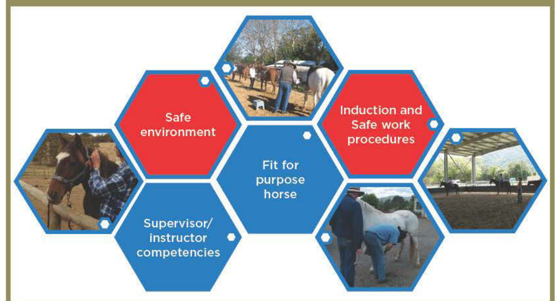
FIGURE 1 Key aspects of managing risks