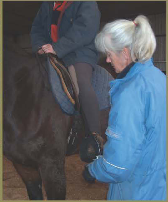
FIGURE 11 Adjust stirrups