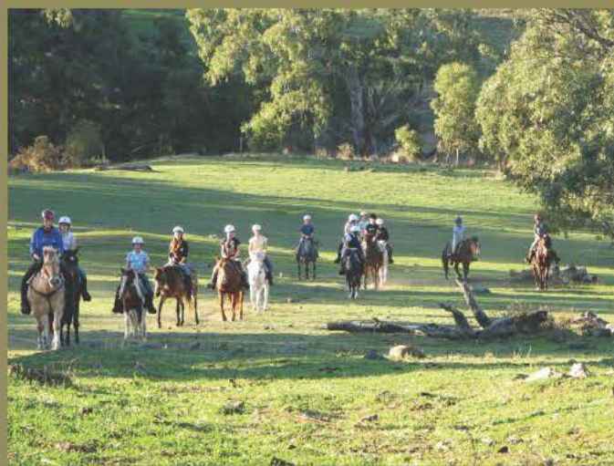
FIGURE 8 Riding in the open