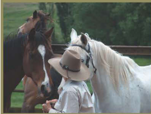
FIGURE 13 Catching a horse in a group