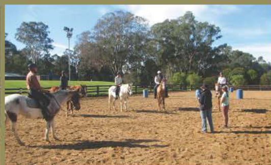
FIGURE 5 Instructor training