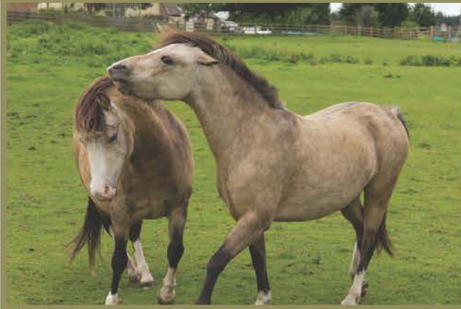
Table 4 Hazards, risks and control measures when riding a horse