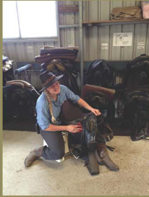
FIGURE 10 Saddle cleaning