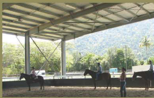
FIGURE 6 Enclosed area with fencing