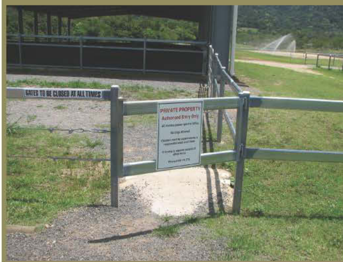
FIGURE 2 Barriers to control access to horses