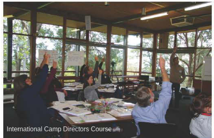
International Camp Directors Course

Newsletters: Members receive regular communication and sector updates through the weekly ACA News, Monthly Updates and Member Bulletins. Members may advertise or post job vacancies at no cost in any of these publications.