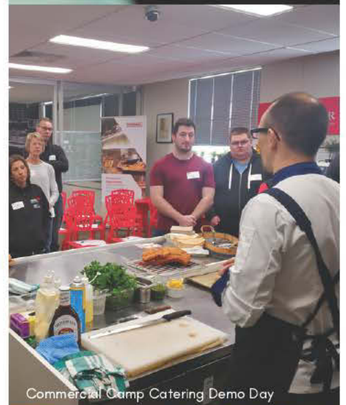
Commercial Camp Catering Demo Day