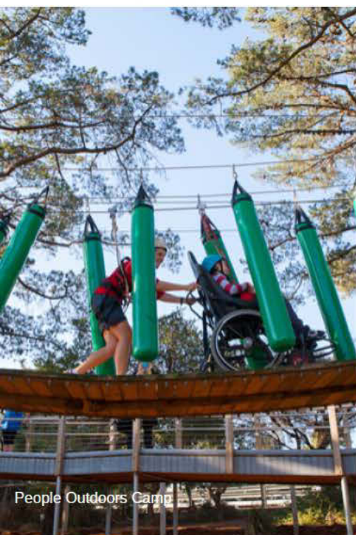
People Outdoors Camp