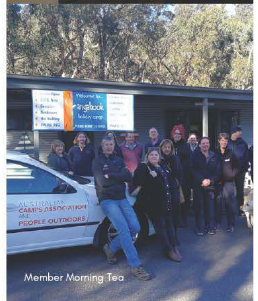
Member Morning Tea