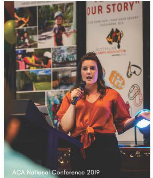
ACA National Conference 2019

Australian Camps Association membership is open to camp operators, associated providers and individuals or organisations with an interest in the camps sector.