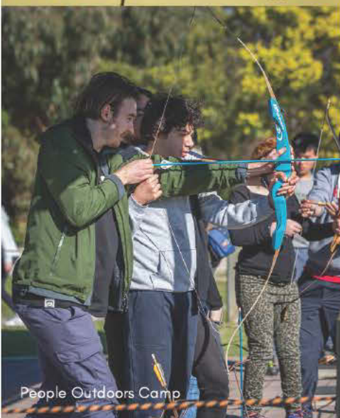
People Outdoors Camp