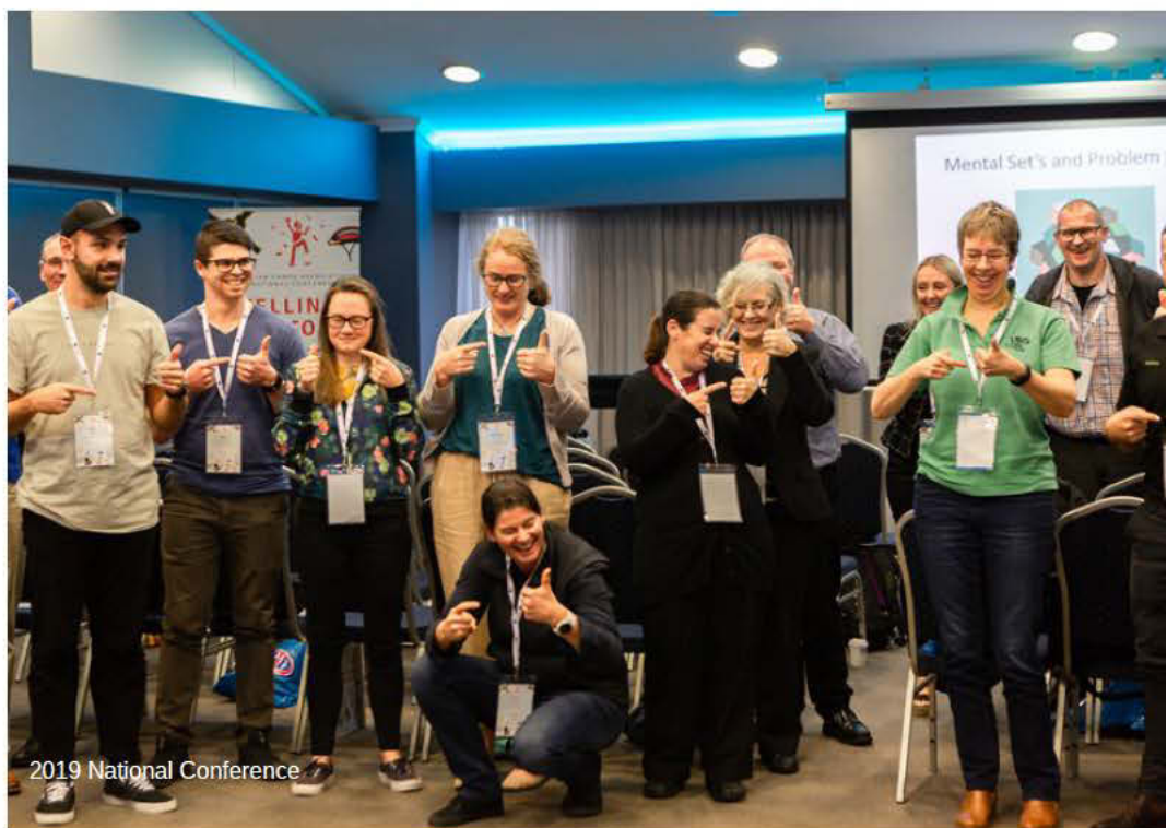
2019 National Conference