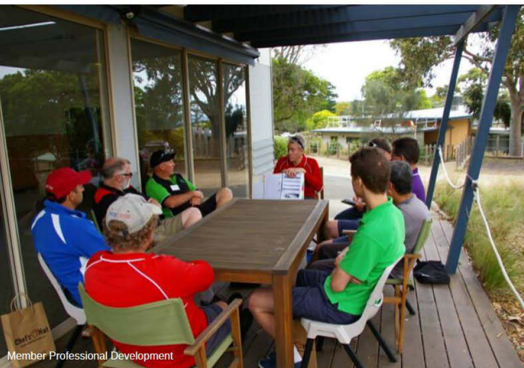
Member Professional Development