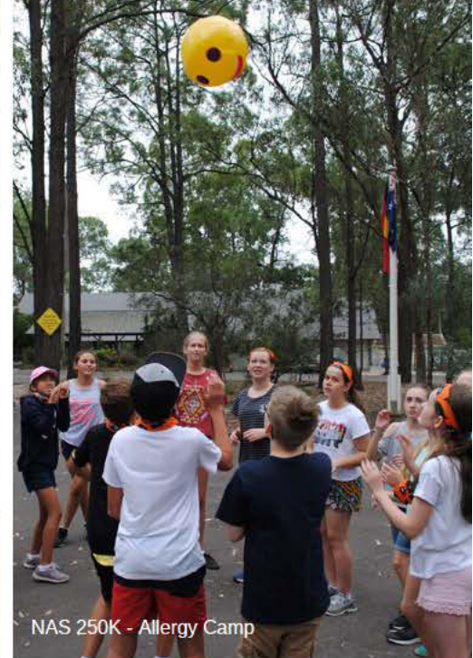
NAS 250K - Allergy Camp