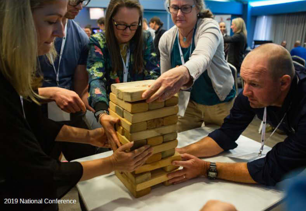
2019 National Conference