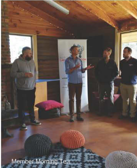
Member Morning Tea