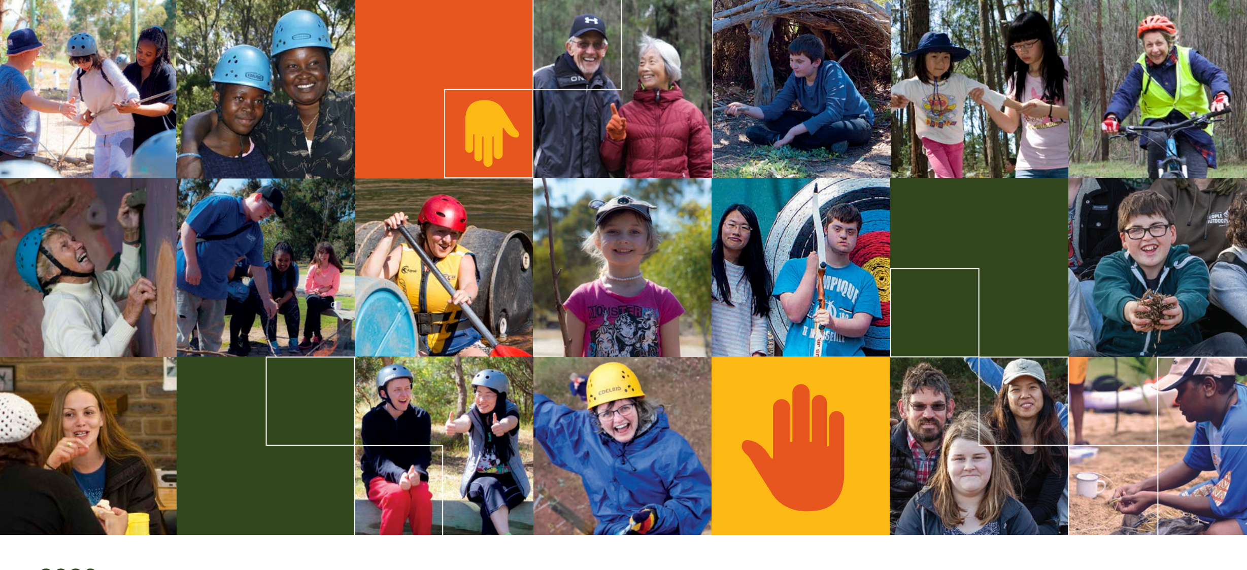
2020 INCLUSION GUIDE & SELF-ASSESSMENT RESOURCE

for Camps and Outdoor Activity Providers